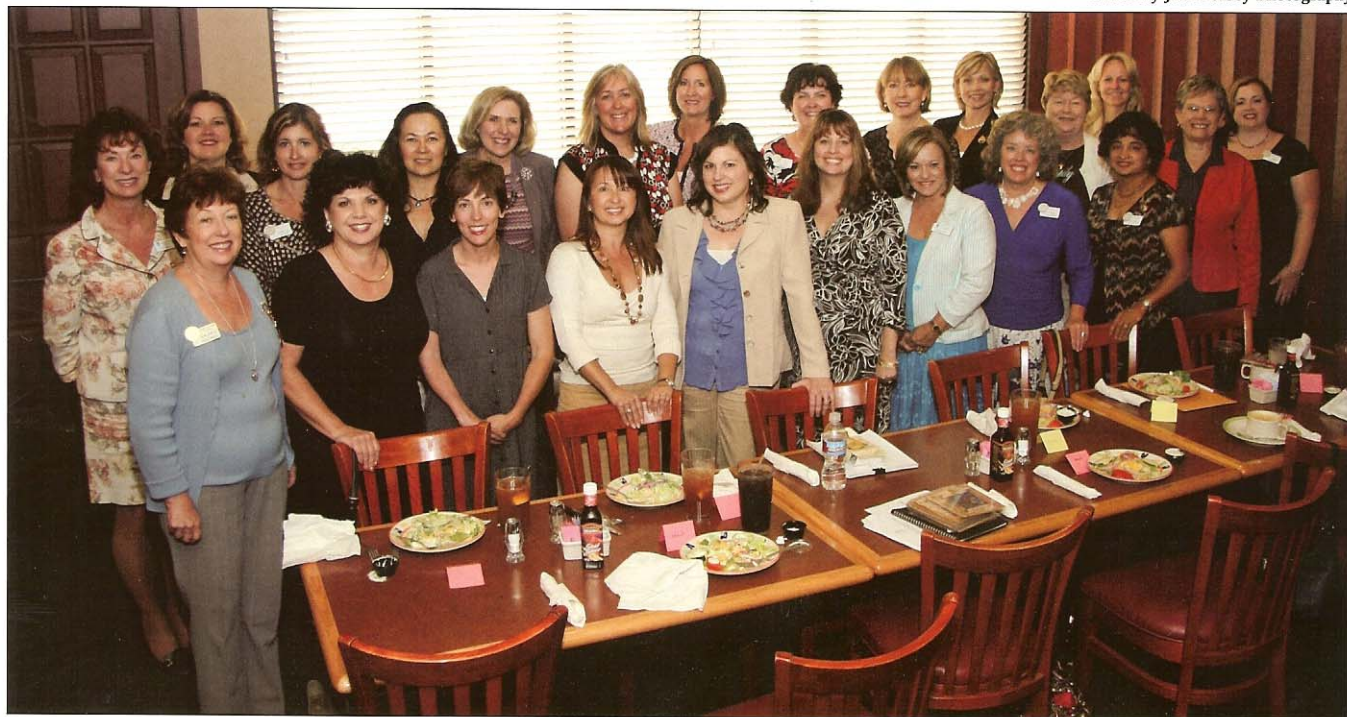
Members of Soroptimist International of Corona at their weekly meeting.